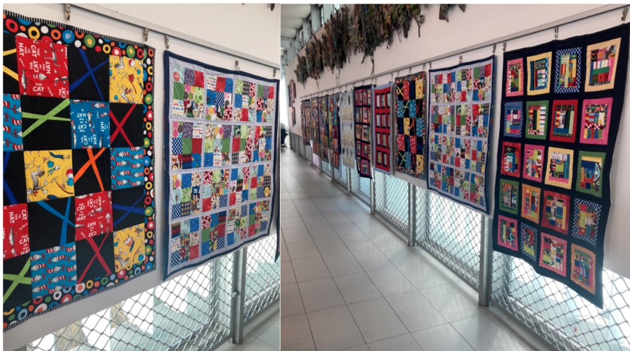
Quilt Display in Upper Riccarton Library