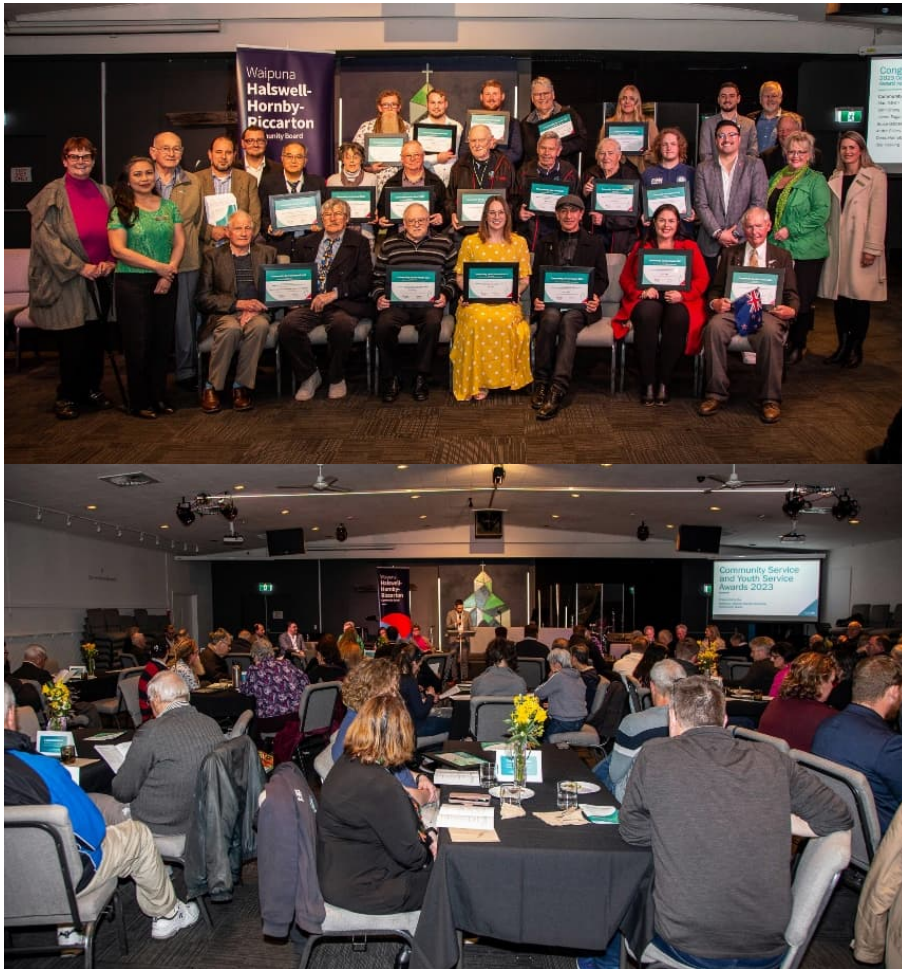
Community Service and Youth Service Awards ceremony