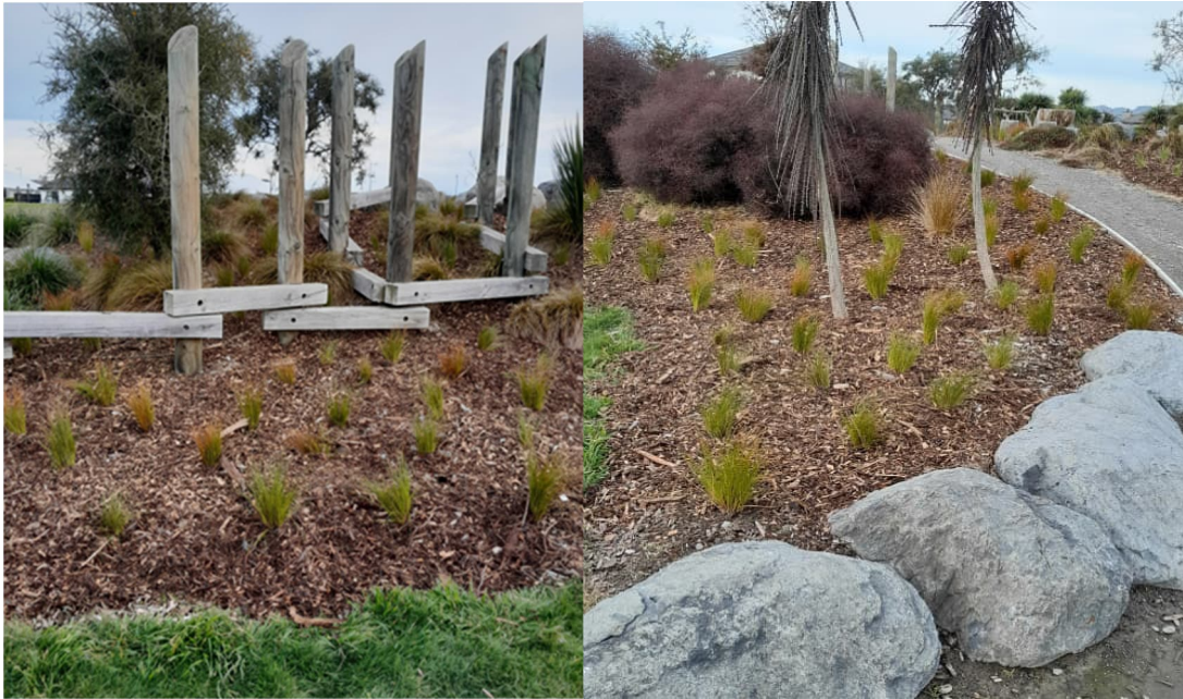
Community Partnership Rangers Sockburn Park (Riccarton)