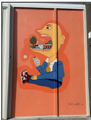
4 Student artist: Piece called enough is enough, consume carefully