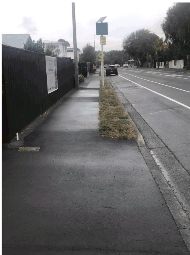
Ellen Hood Presentation Photos – Rossall Street