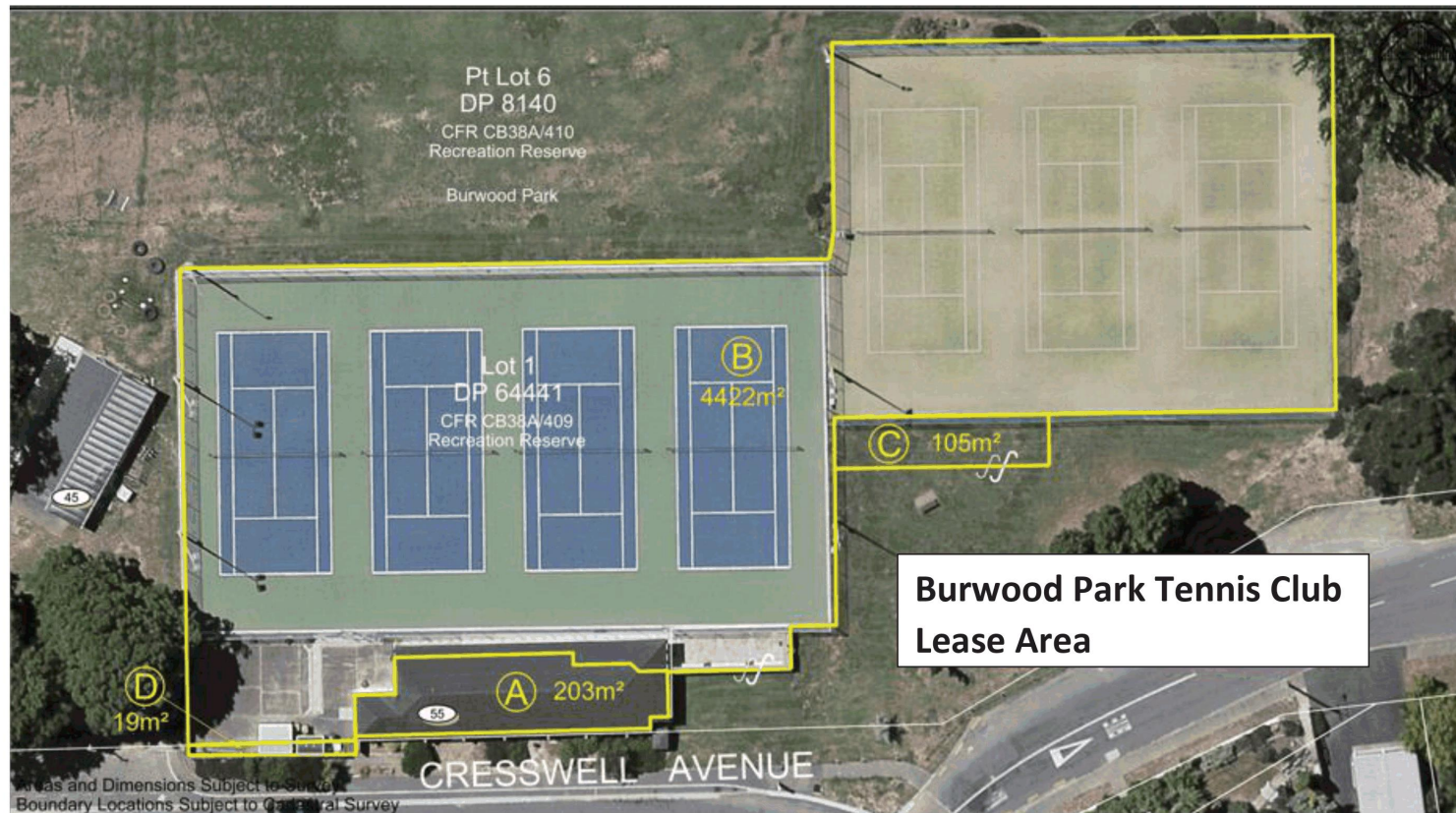
Attachment B - Burwood Park Tennis Club Site Map (Clubrooms and Courts Lease Area)