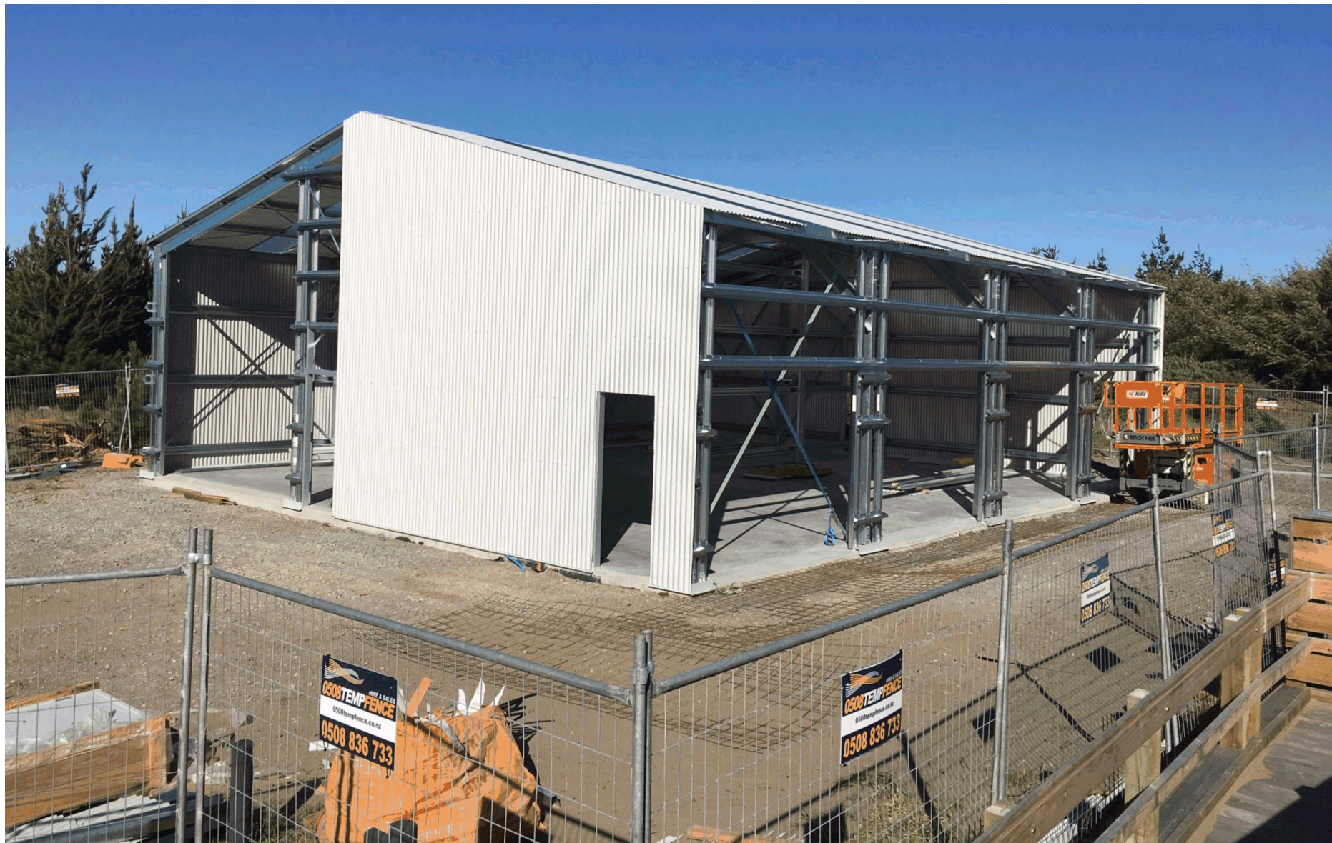
New Rescue Boat and yacht storage shed underway - this completes our rebuild from the earthquakes