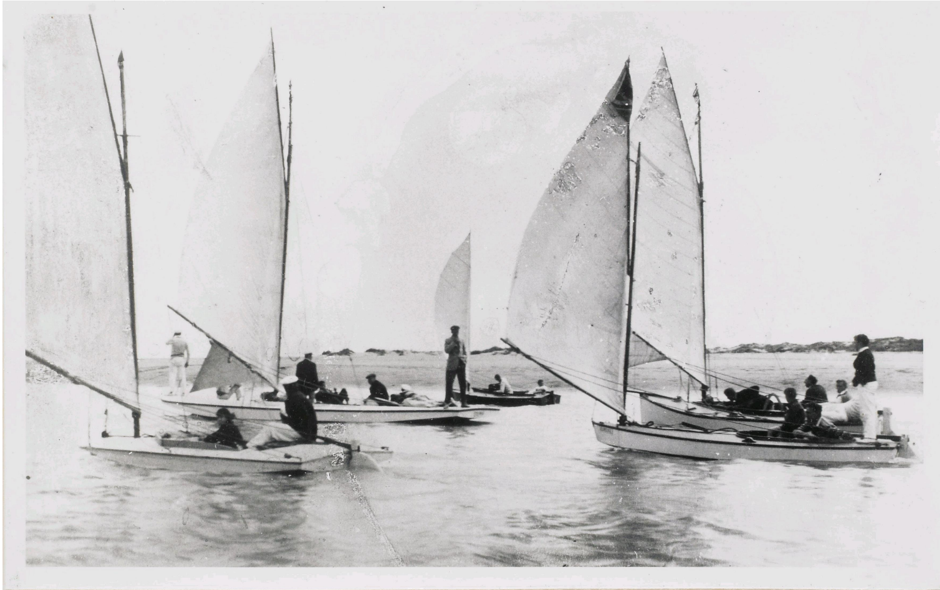
That was then ... PPYC fleet sailing in 1929