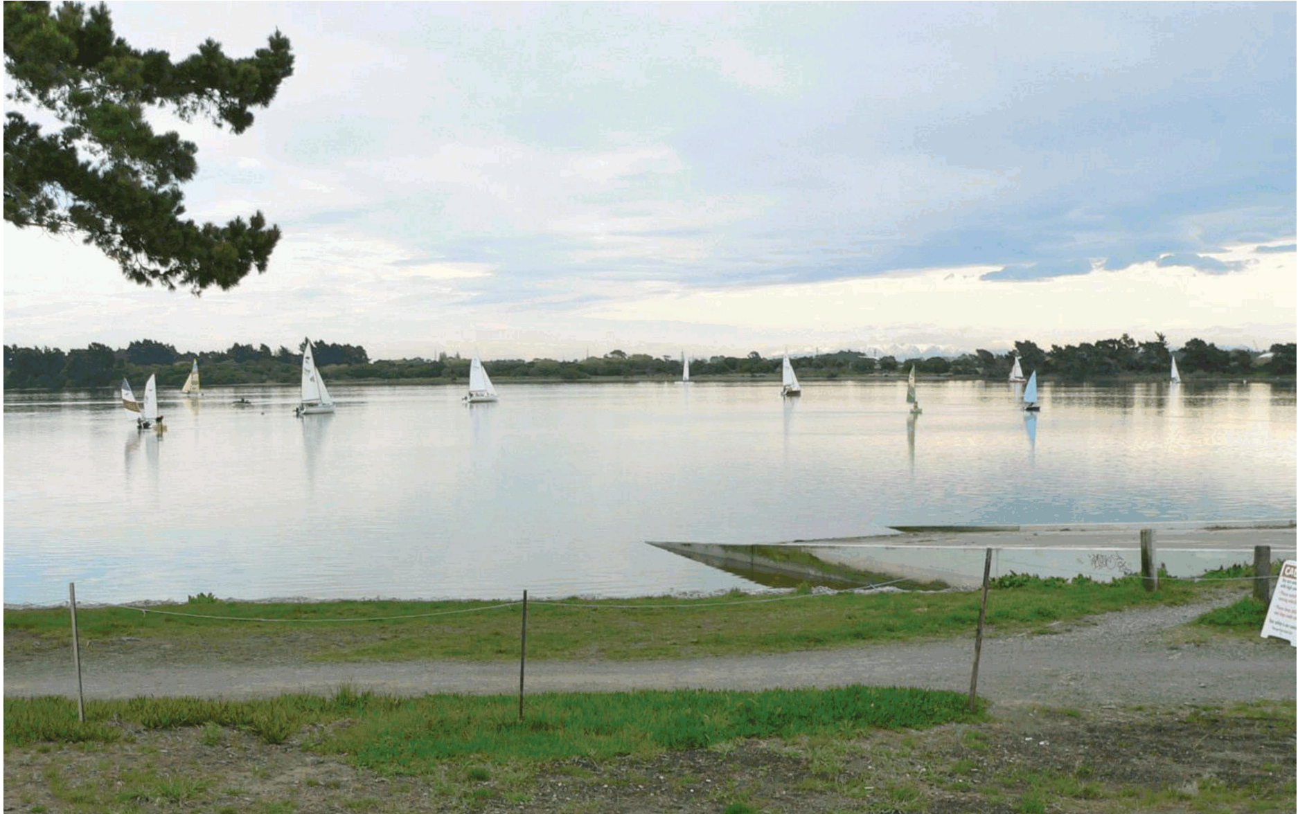
Opening Day, 13th September - Part of the fleet of 24 yachts in our Opening Day race