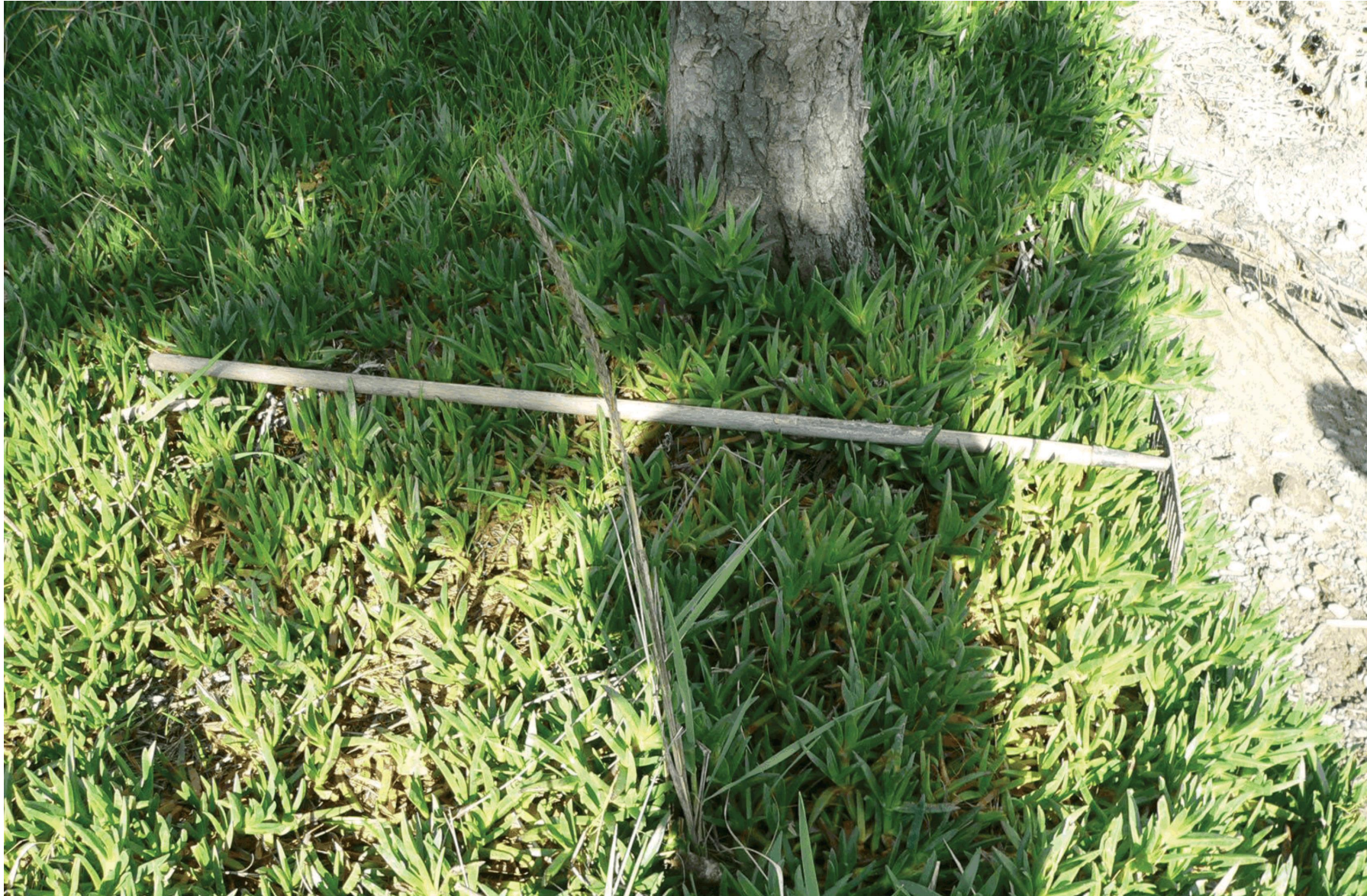
The Club is concerned about the on-going erosion of the South New Brighton Park shoreline