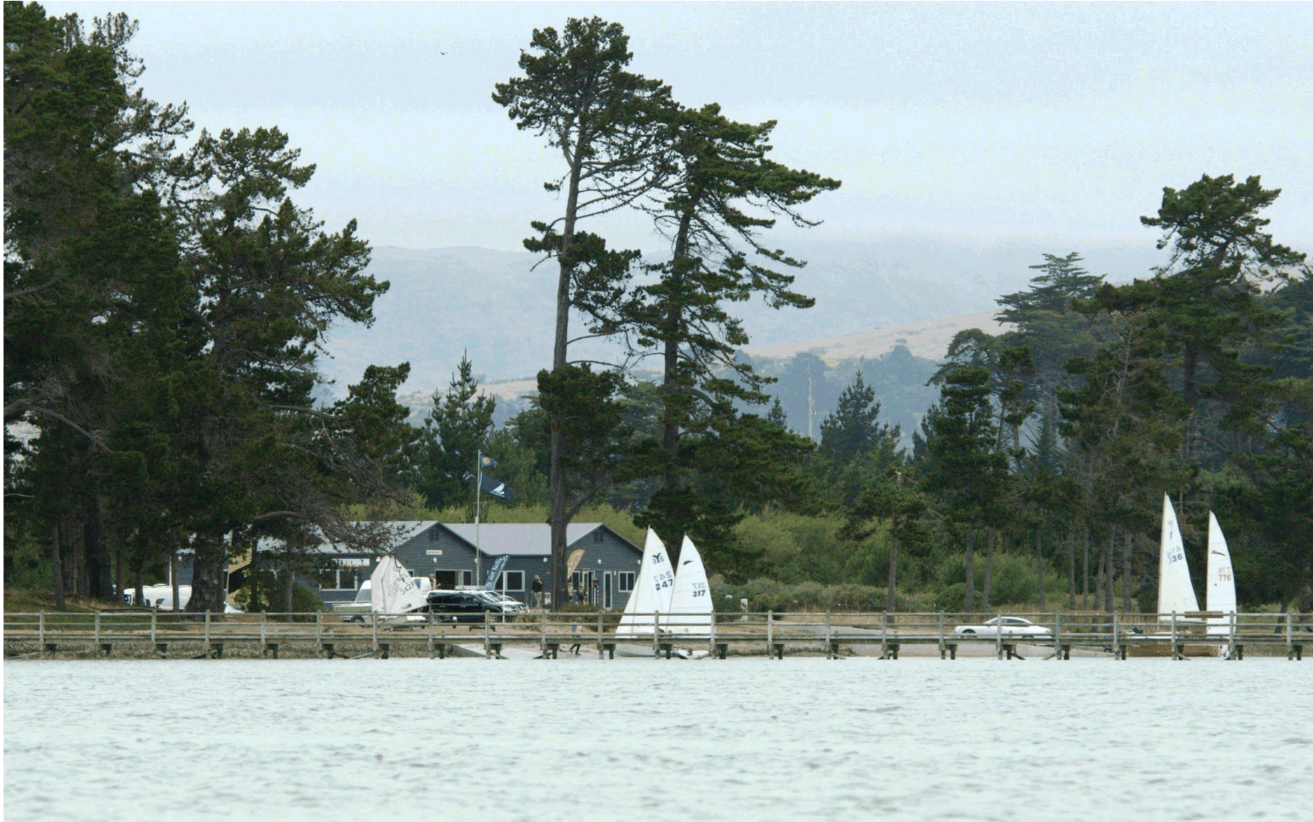
2019-20 - Our first season working out of our new Club facilities