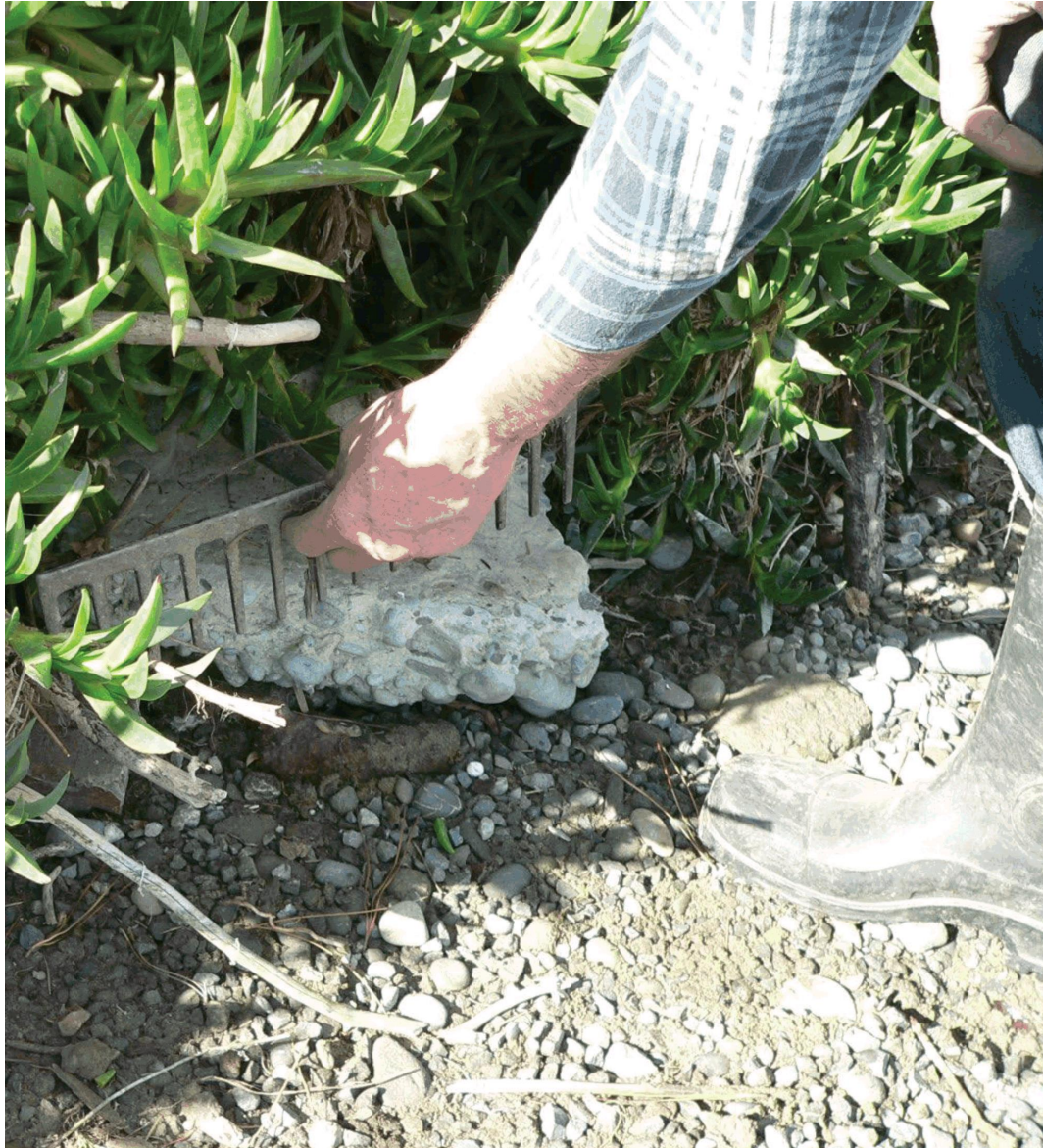
The rake pushed under the over hanging Ice plant