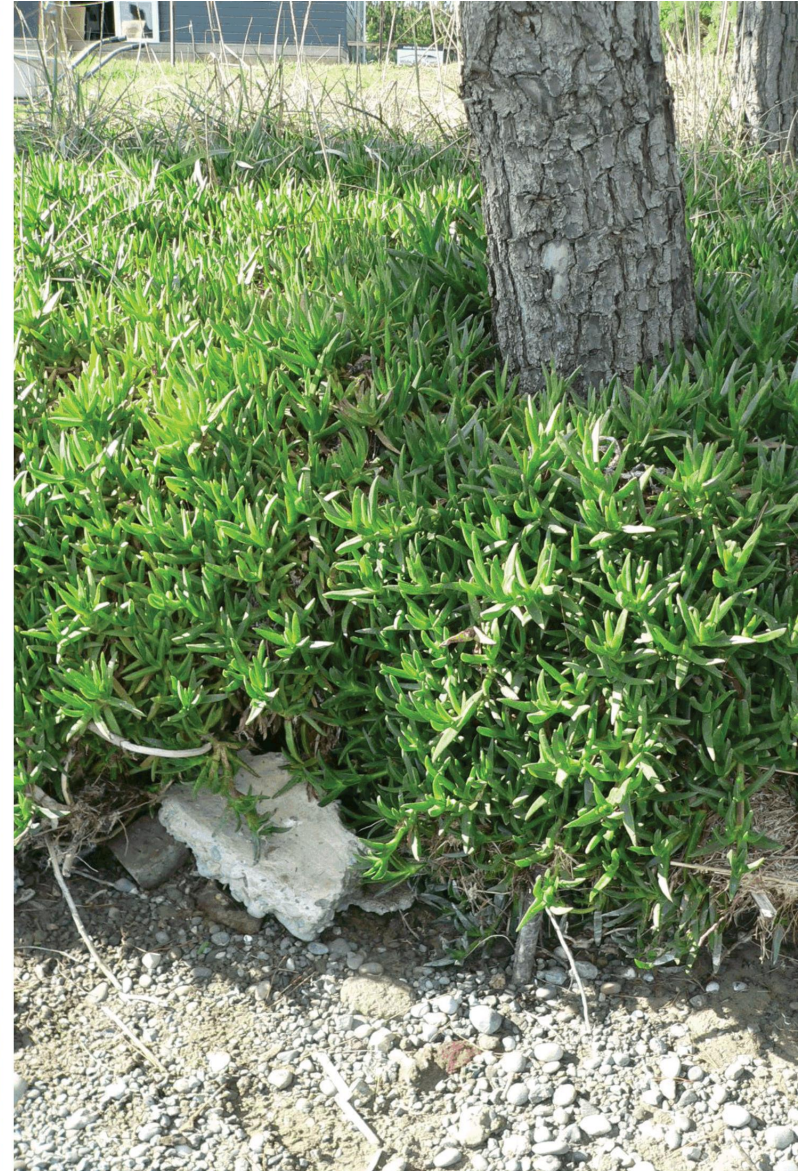
The location relative to the Club's new buildings