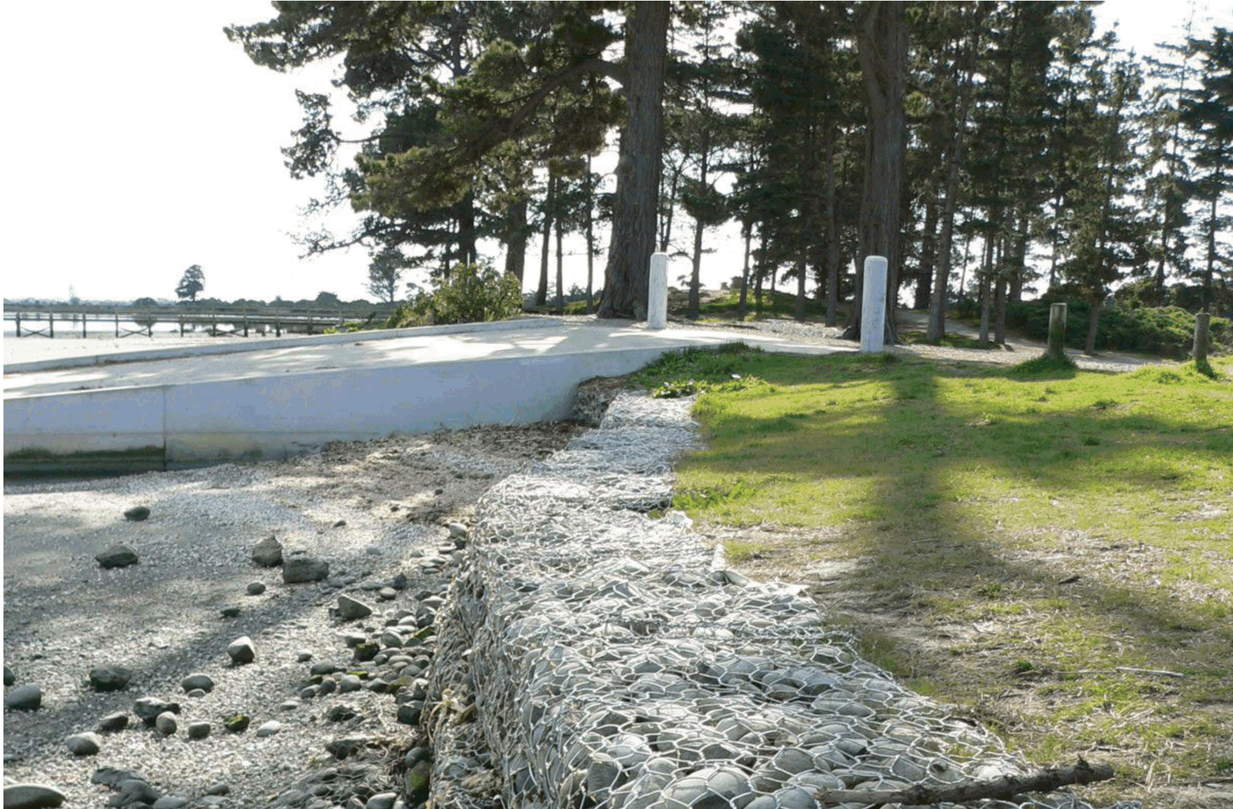
The construction of our new ramp included Gabion baskets either side to protect the shoreline from erosion