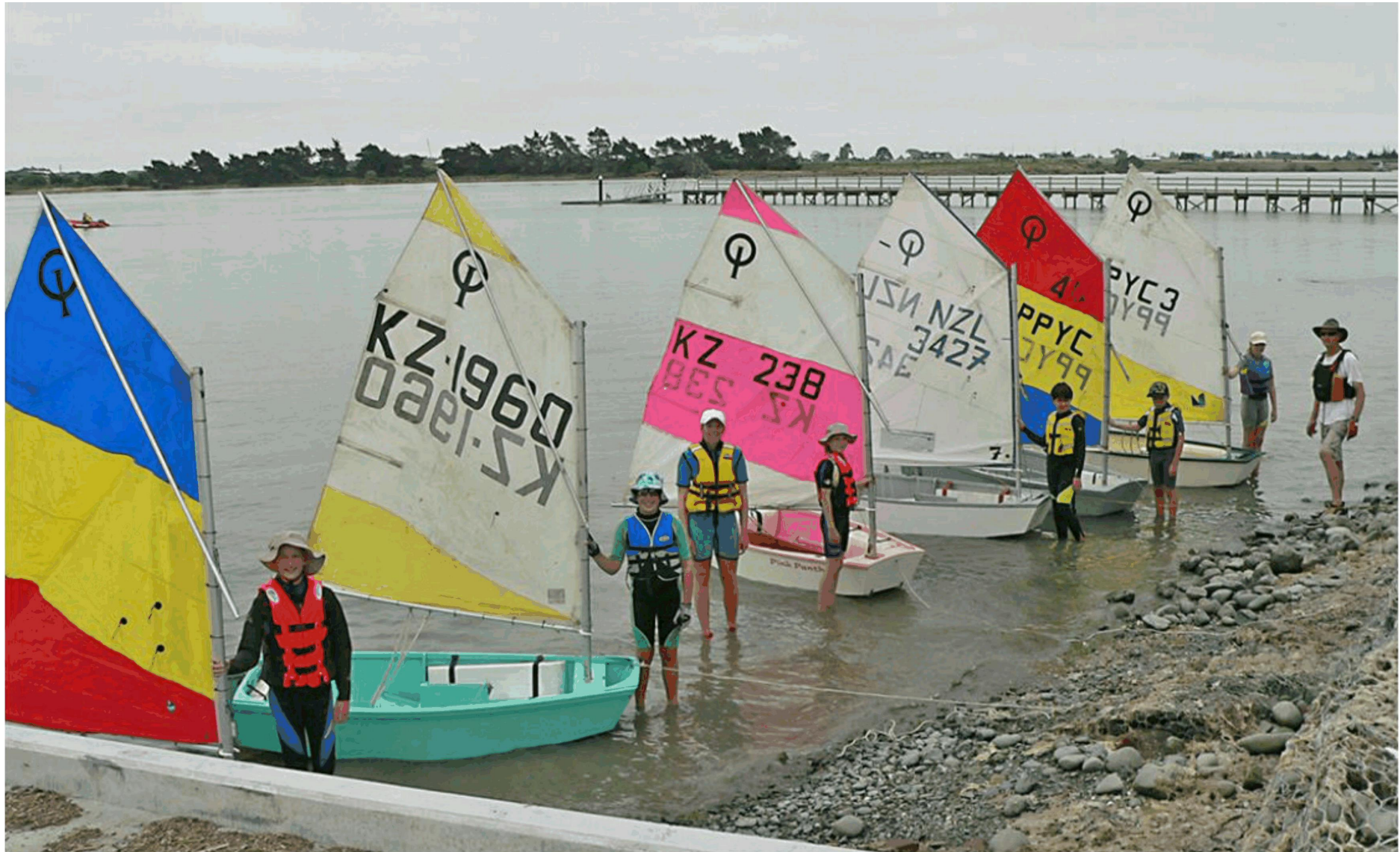
October school holiday Junior Learn to Sail programme planned, along with an Adult Learn to Sail programme