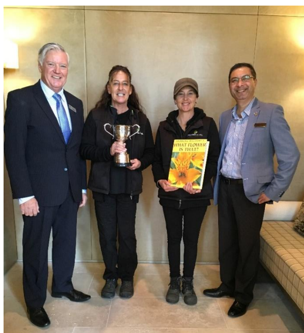
South Island Promotion Association Garden Award (Commercial) – The Russley Village