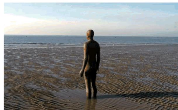
Intertidal sculpture by Anthony Gormley, Crosby

Repair of the Estuary Edge of Southshore and South New Brighton