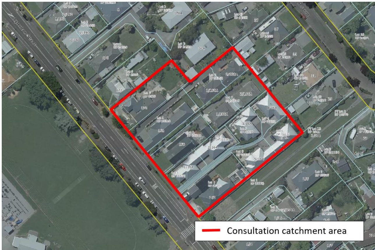
Figure 1: Bus parking on Lyttelton Street beside West Spreydon School, consultation catchment area