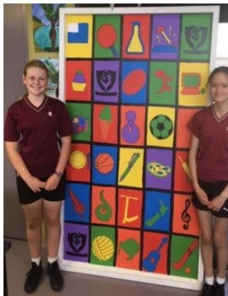
Casebrook Intermediate School