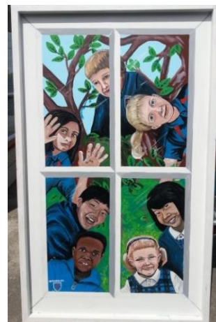
Emanuel Christian School