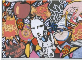
Papanui High School

With the completion of the artist's mural on the Bishopdale Village Green wall the school art panels will be the next instalment of the project. Five local schools took on the task of completing a 2.4 metre by 1.2 metre art panel each with a theme of, "Windows over Bishopdale". The schools are; Islesworth School, Papanui High School, Emanuel Christian School, Breens Intermediate School and Casebrook Intermediate School. Four of the school panels have been completed and are ready to be hung on the wall, as shown in the pictures below.