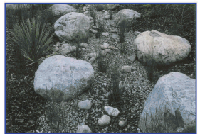
DRY RIVERBED GARDEN