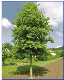
SPECIMEN TREE Platanus orientalis (Oriental Plane Tree)