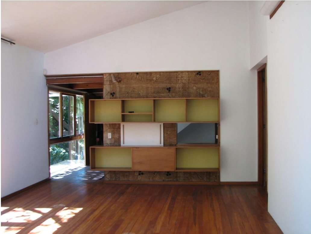
The living area with the door to be modified shown on the right.