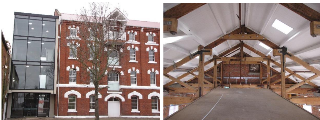
The refurbished Mill and new circulation tower and the fourth floor interior, August 2018.