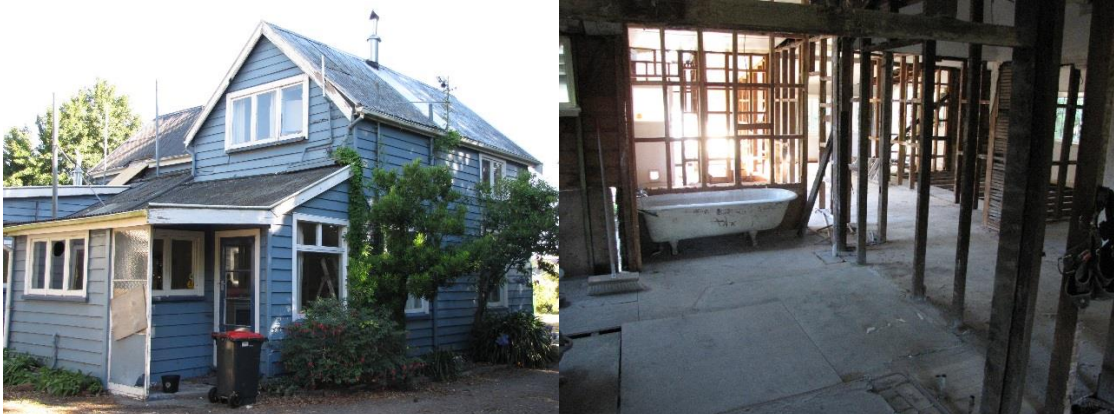
64 Opawa Road, Works underway in February 2019.