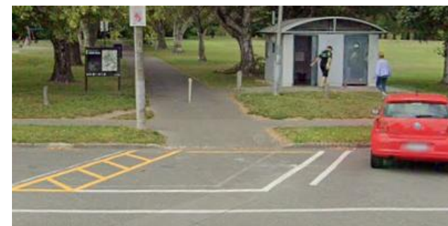
Greers Road / Jellie Park entrance