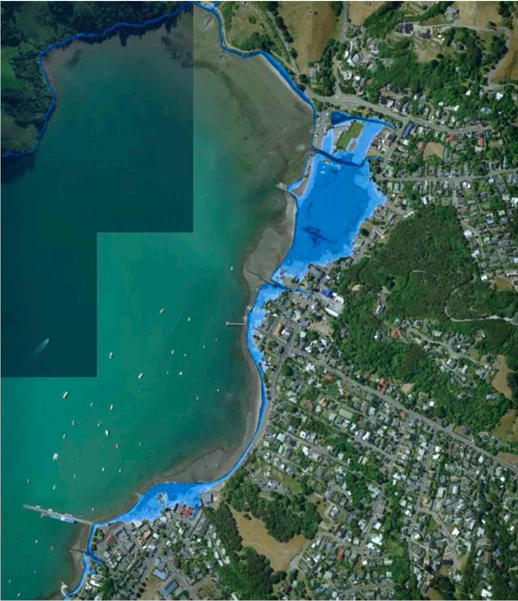
Coastal flooding during a '1 in 100 year' (rare) storm at current sea level