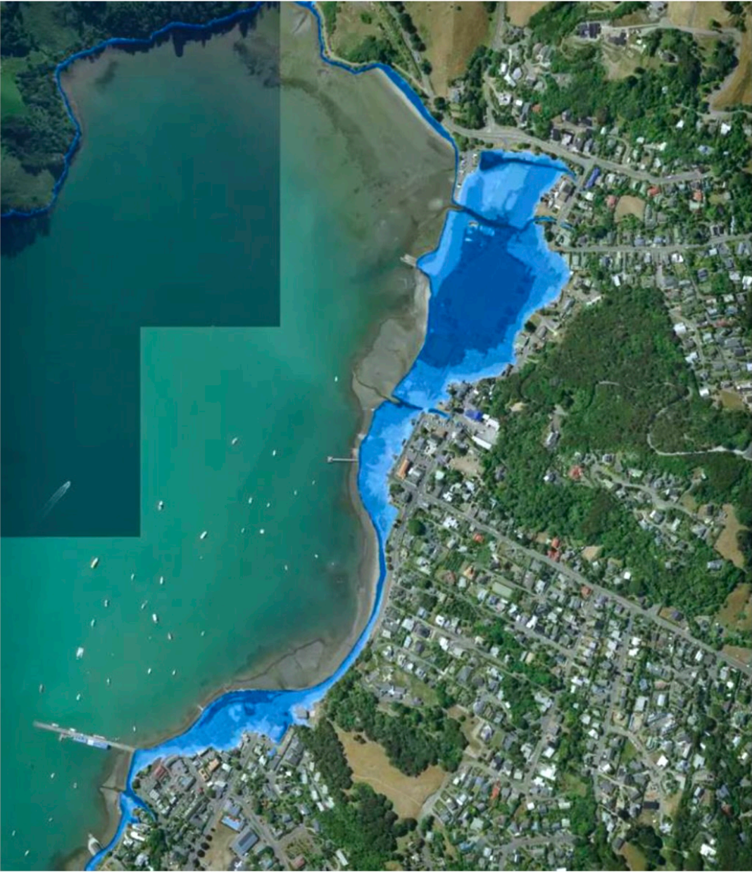
Coastal flooding during a '1 in 100 year' (rare) storm event with 40cm of sea level rise