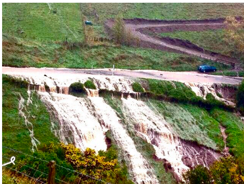
Akaroa and The Bays are an isolated community of interest - Highway 75, April 19, 2014

Courtesy Christchurch City Council, May 3 2025 (The X marks the location of the Akaroa Health Hub)