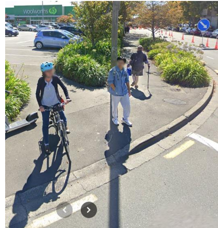
Woolworths Corner – Moorehouse Ave and Madras St