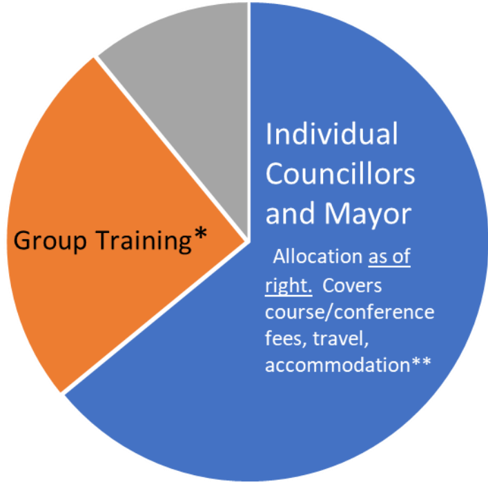
■ Individual allocation ■ Group training ■ Contestable