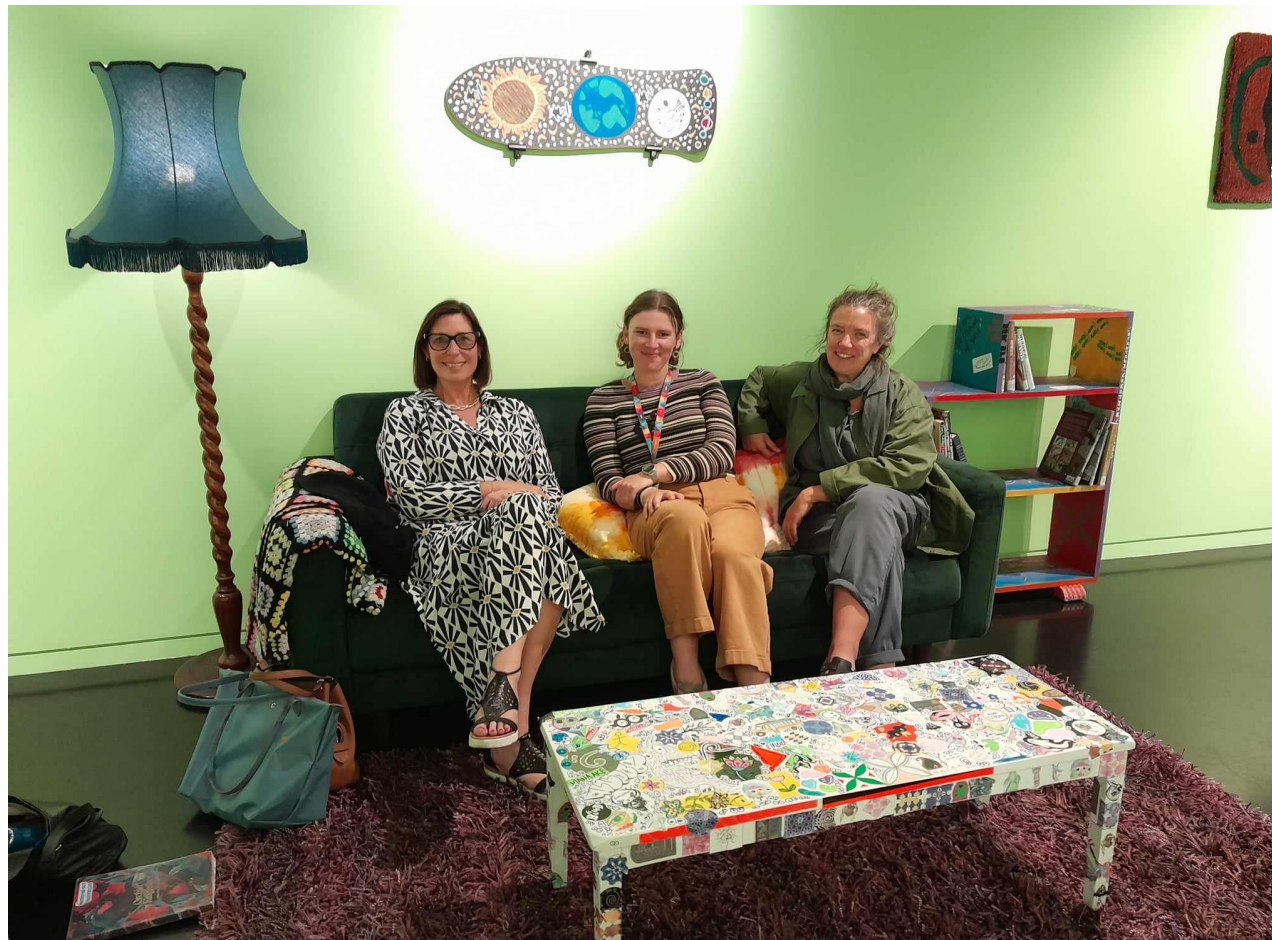
Sanctuary lounge scene