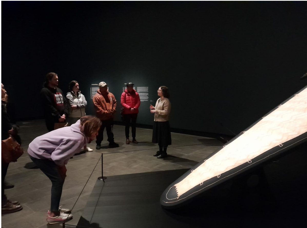
Visiting Christchurch Art Gallery – Te Rā