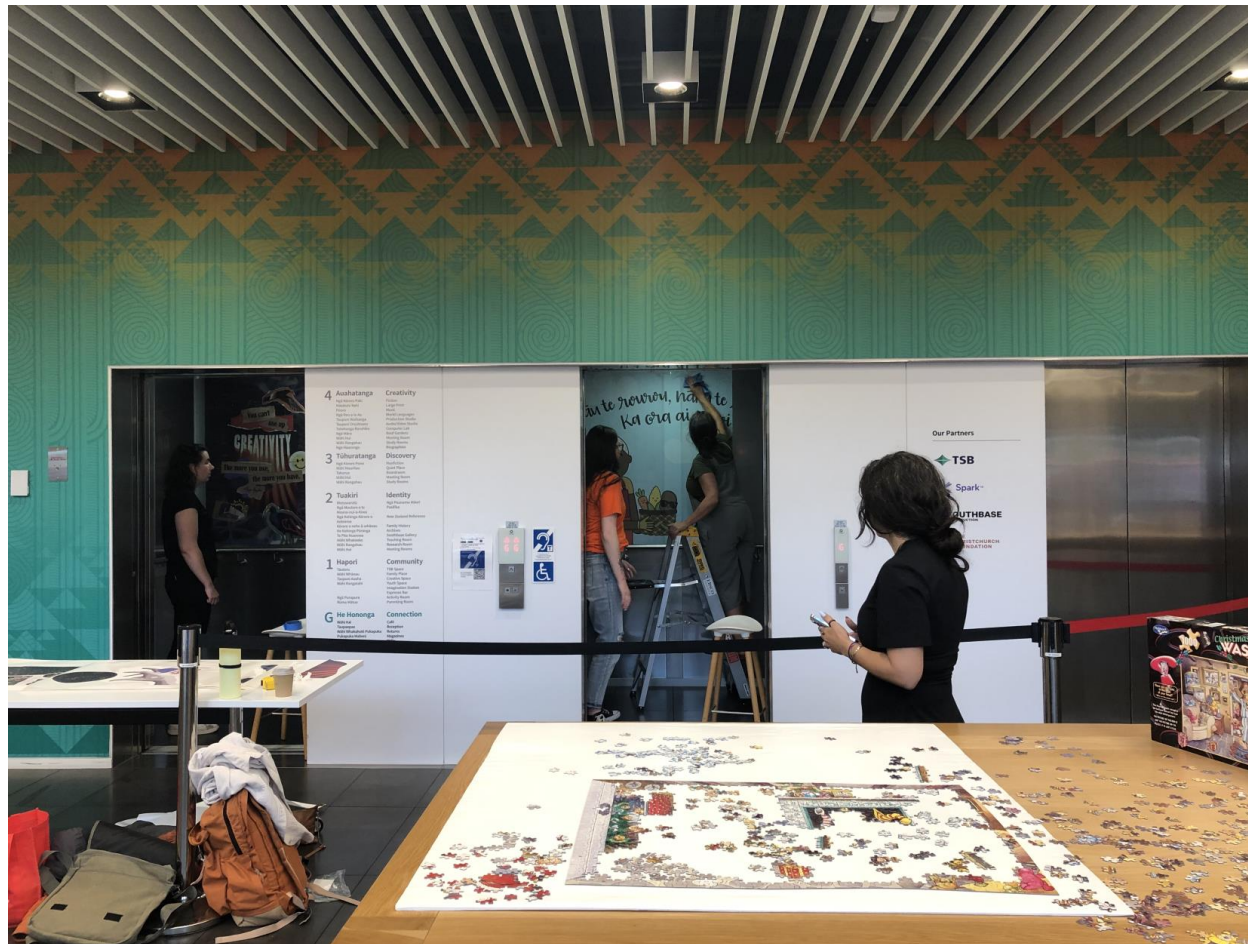
Sanctuary - installing lift artworks at Tūranga