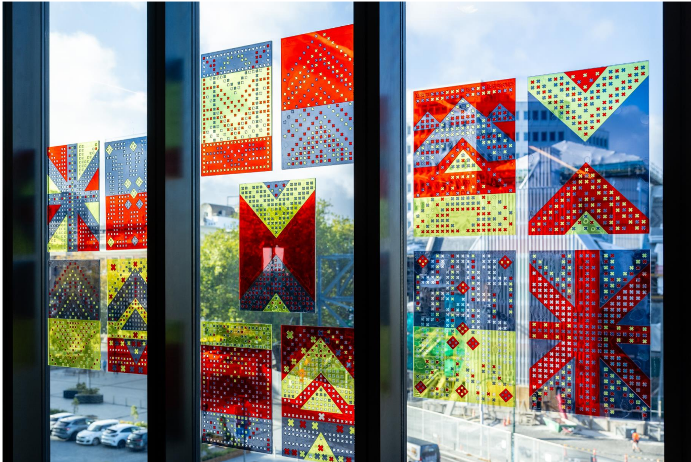
Tukutuku inspired stained glass artworks