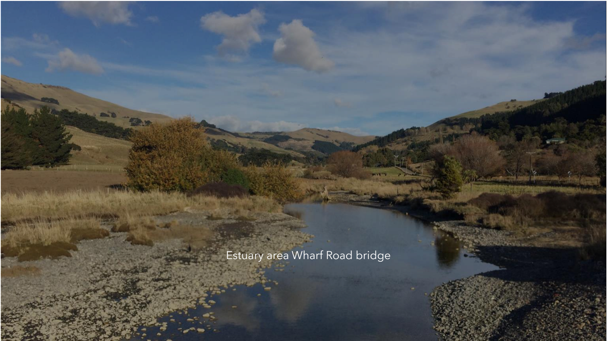
Estuary area Wharf Road bridge