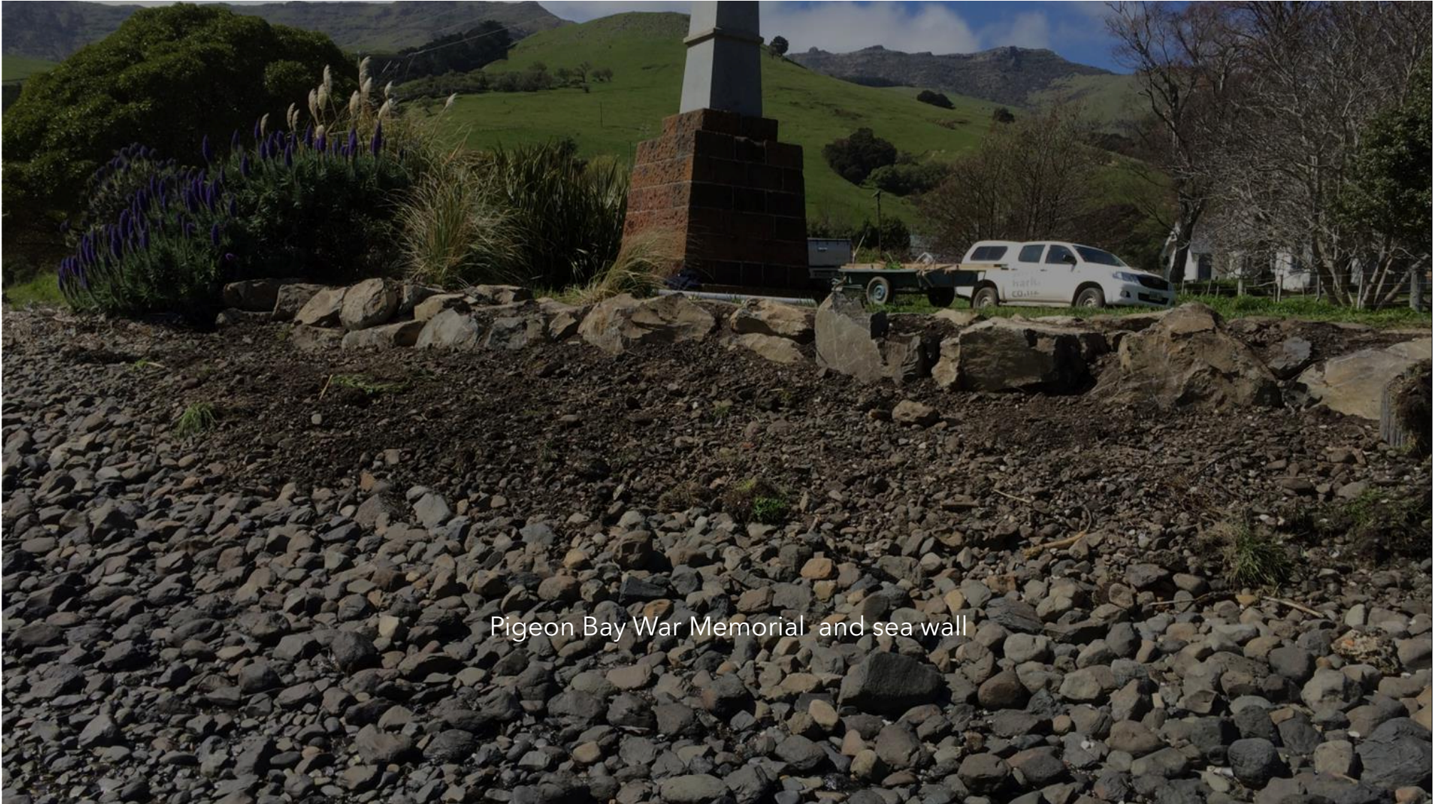
Pigeon Bay War Memorial and sea wall