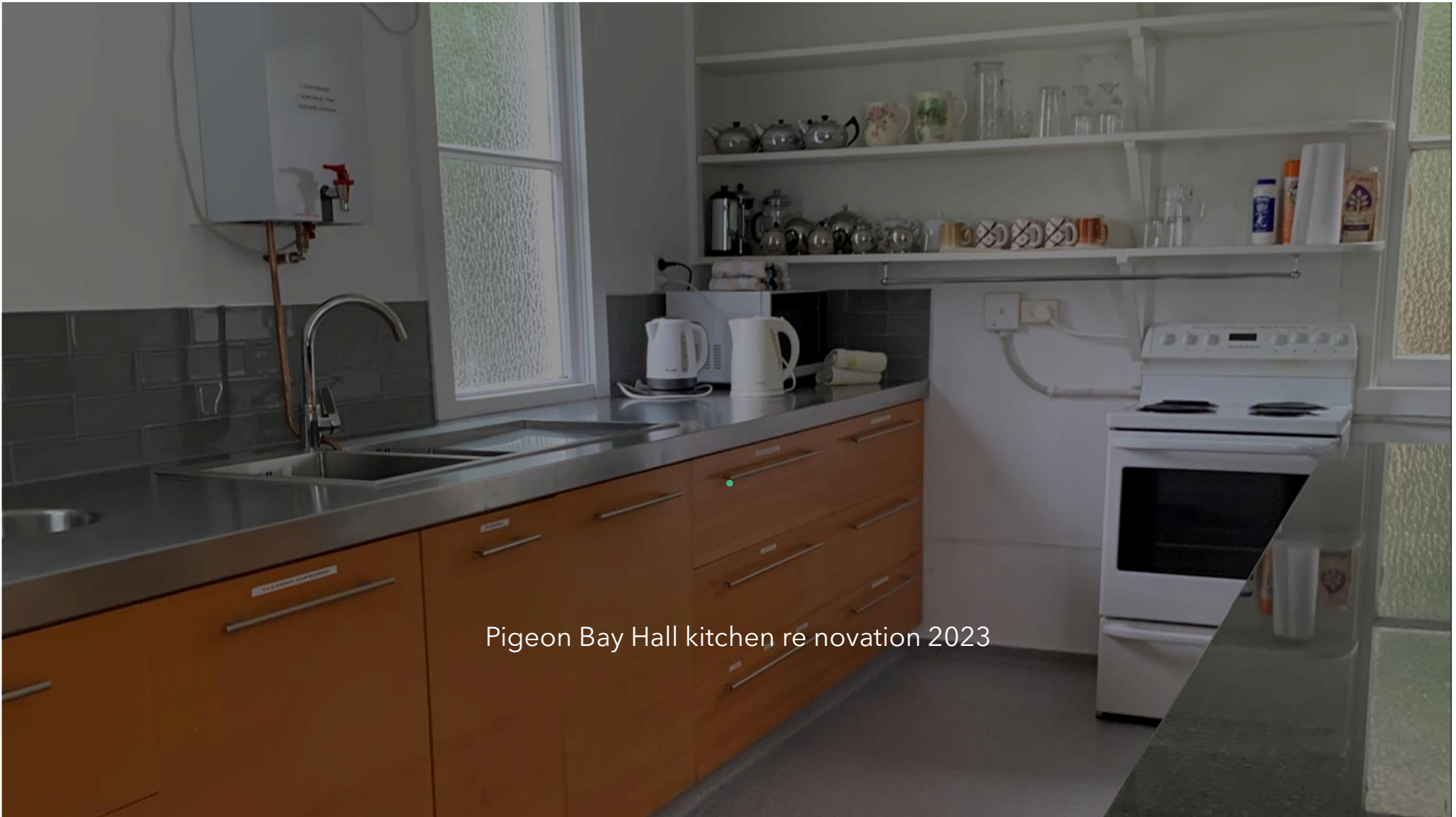
Pigeon Bay Hall kitchen re novation 2023