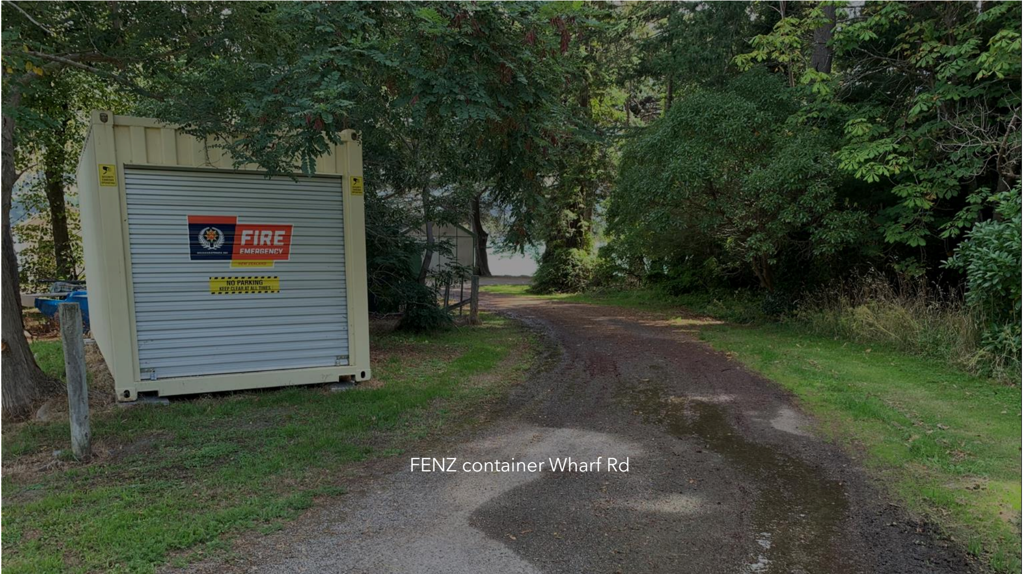
FENZ container Wharf Rd