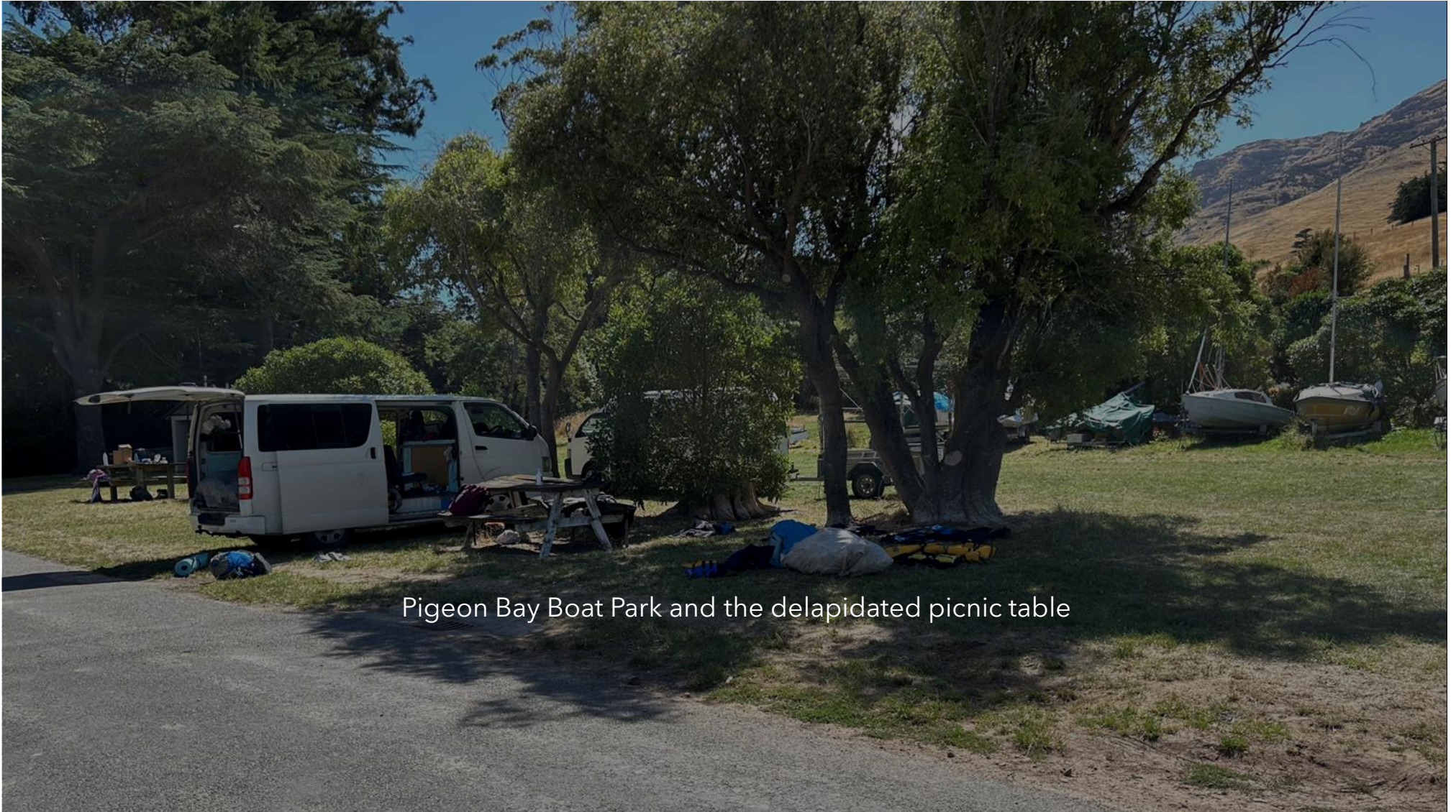
Pigeon Bay Boat Park and the delapidated picnic table