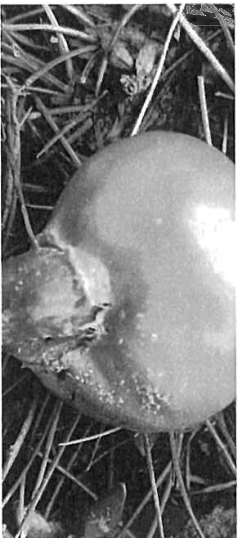
The rare mushroom Nivatogastrium baylisianum , not seen for 44 years, photographed by Tamper Katy Warburton in central Otago. inaturalist.nz/observations/9860135

For our top discoveries, see inaturalist.nz/pages/discoveries-nz