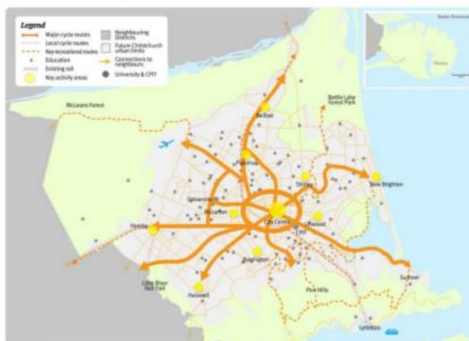
Figure 3.1. Future cycle network: major, local and recreational cycleways (Christchurch Transport Strategic Plan).

Ten years on - more done than not done, big gaps elsewhere but good coverage in West and Southwest