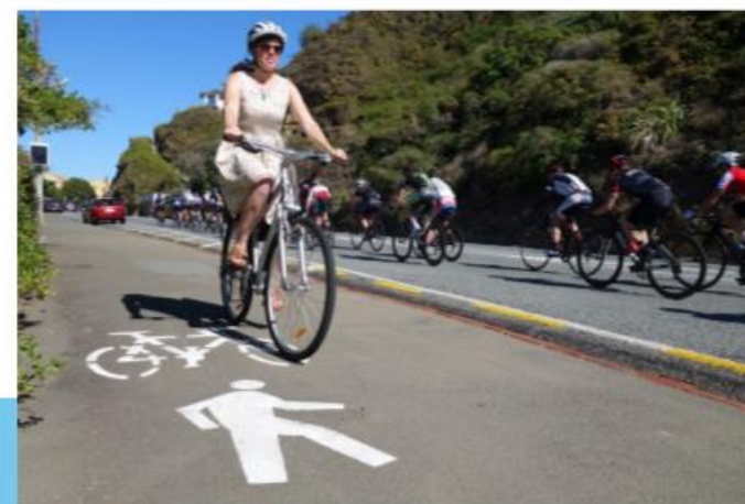
'S&F' vs 'IbC'