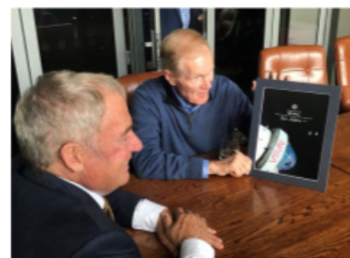
Figure 3 Meeting NASA Administrator Bill Nelson on his recent visit to Christchurch