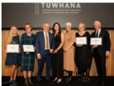
Figure 1 Launching Tūwhana, a Business Events Advocate Programme with Christchurch NZ