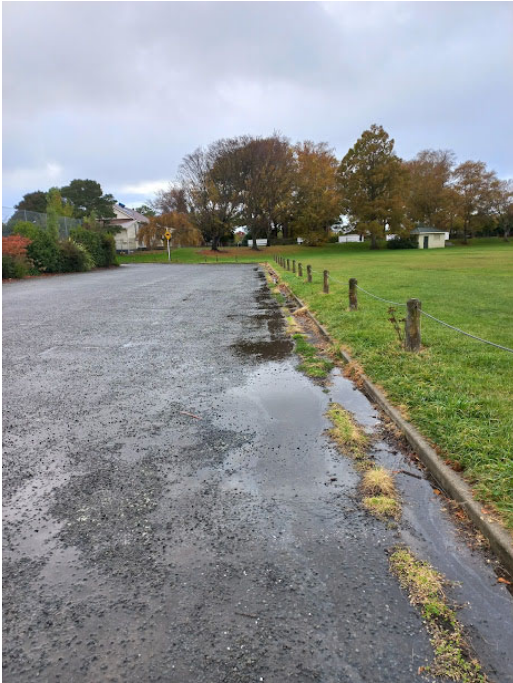
Additional: Condition of surface after rainfall (Taken on May 10, 2022)