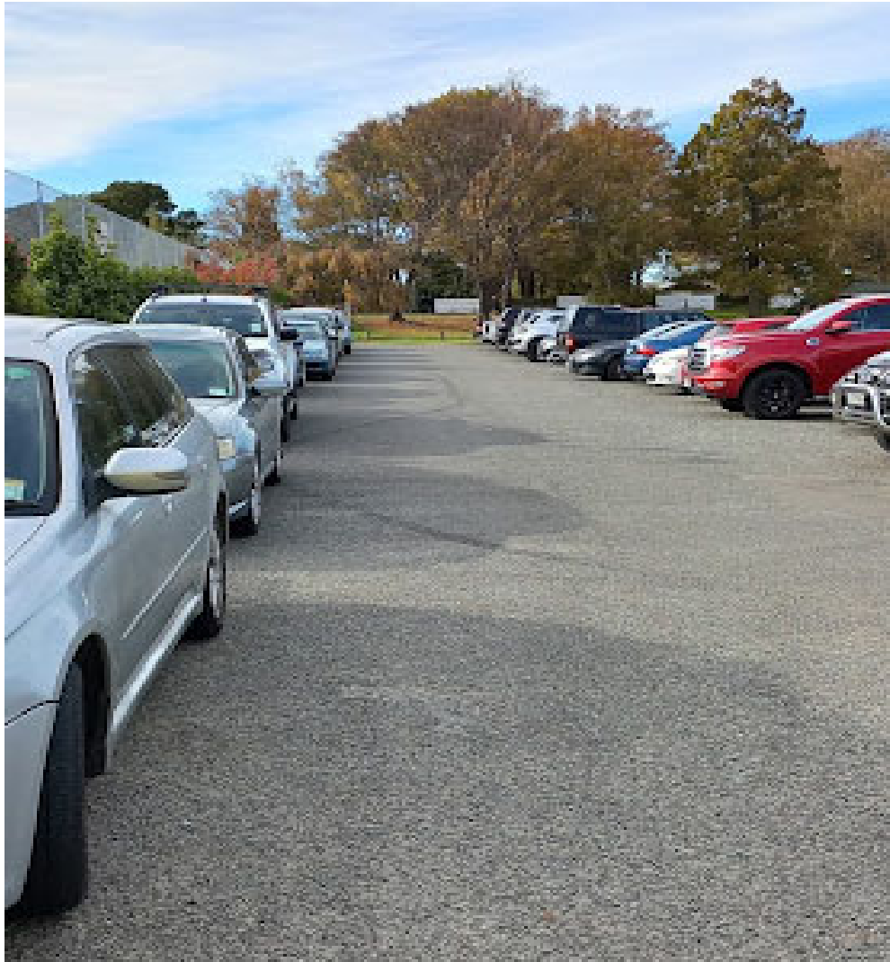
Additional: Car park usage during sport day on a Saturday afternoon. Cars are parked all the way up to Domain Terrace on both sides (including in the no parking zones). Photo taken May 7, 2022