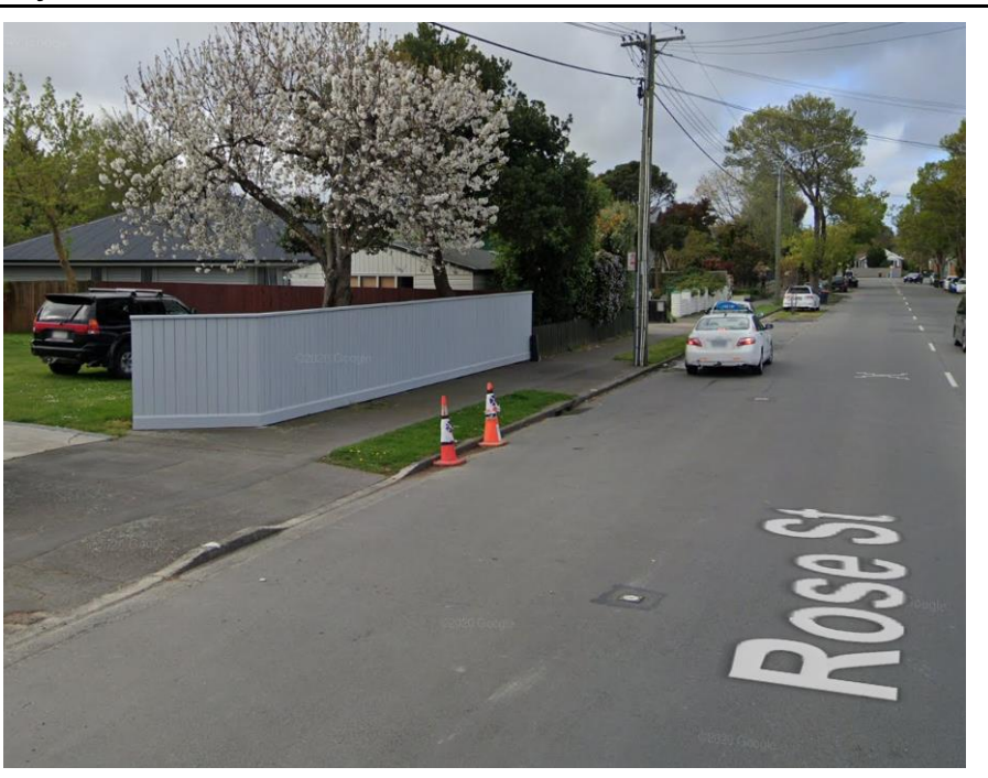
Figure 2: Existing bus stop at 131 Rose Street.