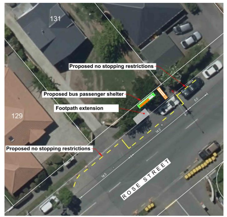
Figure 1: Proposed bus stop beside 131 Rose Street.

3.2 The location of the bus stop and proposed improvements can be found in Figure 1.