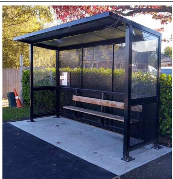
Figure 3: Example of bus shelter