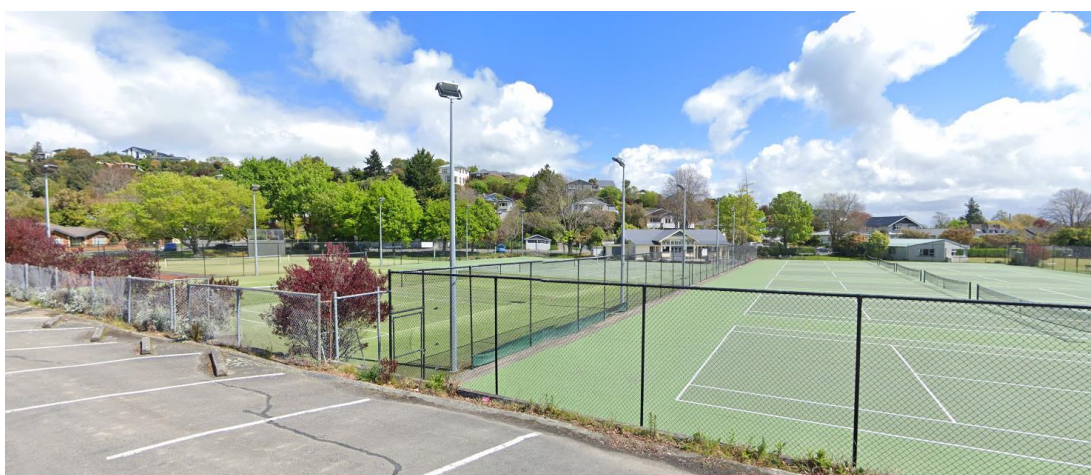
3.7 View of courts from Crichton Terrace including lighting poles

3.8 It is the view of staff that Cashmere Tennis Club Inc. does meet criteria for a new lease application to be processed: