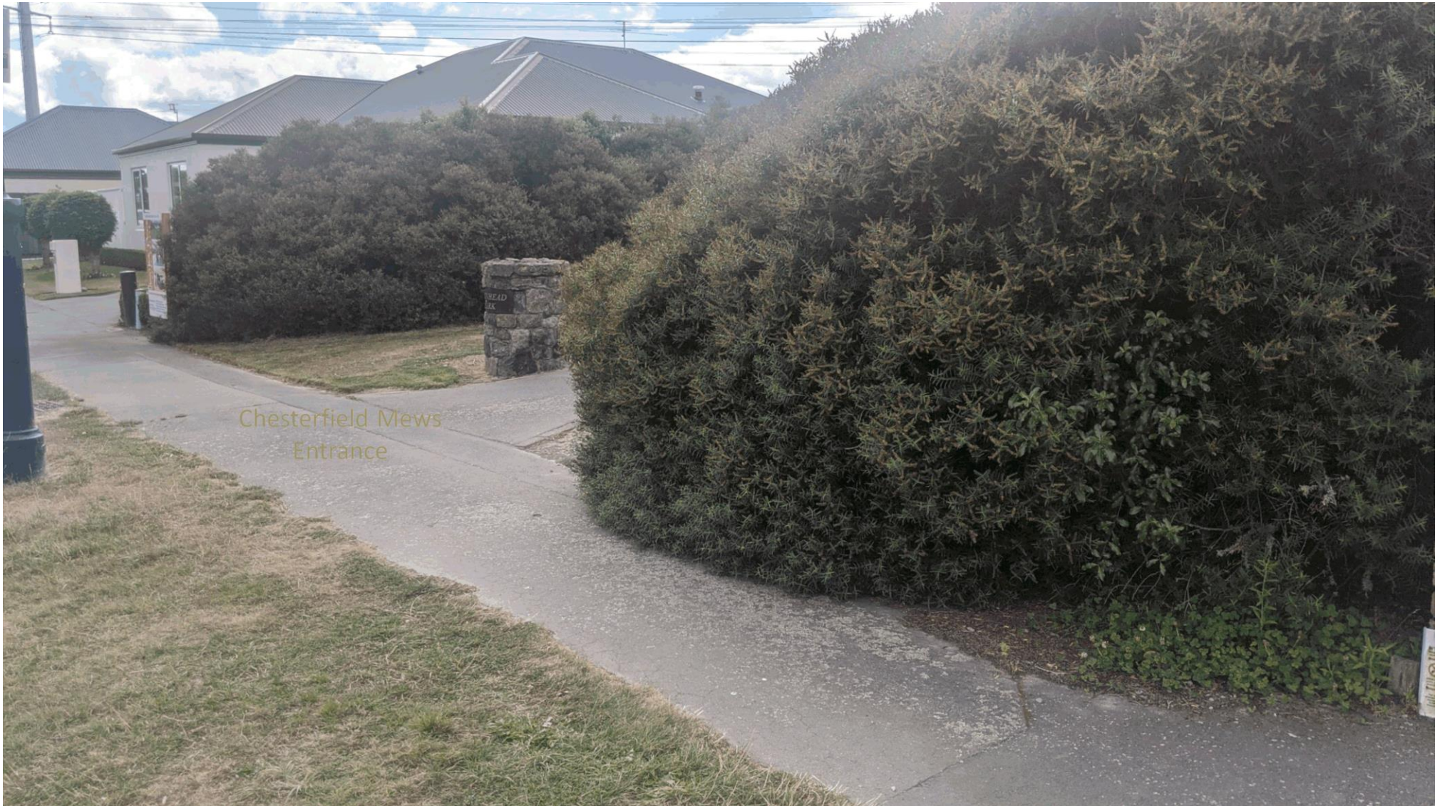
Chesterfield Mews Entrance