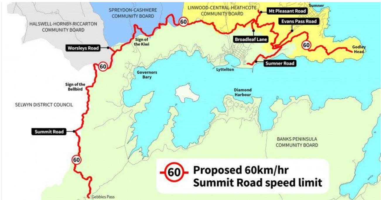
Speed limit review area