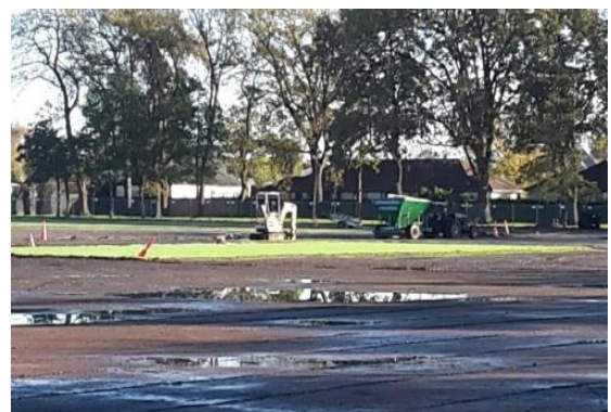
The wicket showing grass