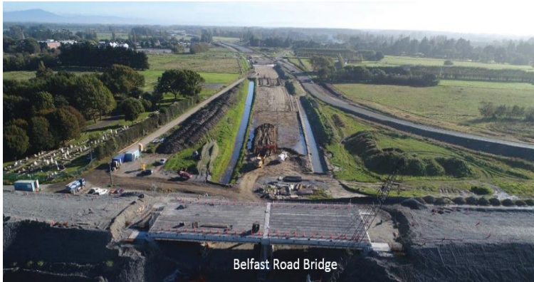
Belfast Road Bridge

Over and Under the CNC Motorway – the three local roads (Belfast, Radcliffe and Prestons) will bridge over the motorway with accompanying pedestrian and cycle lanes. Excellent progress is being made on building the new Belfast and Radcliffe Road overpasses.