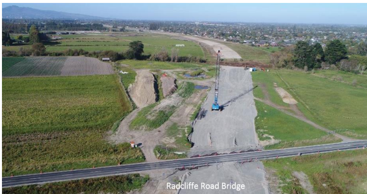
Radcliffe Road Bridge