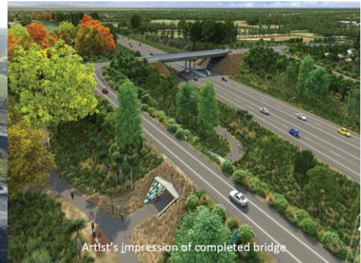
Artist's impression of completed bridge