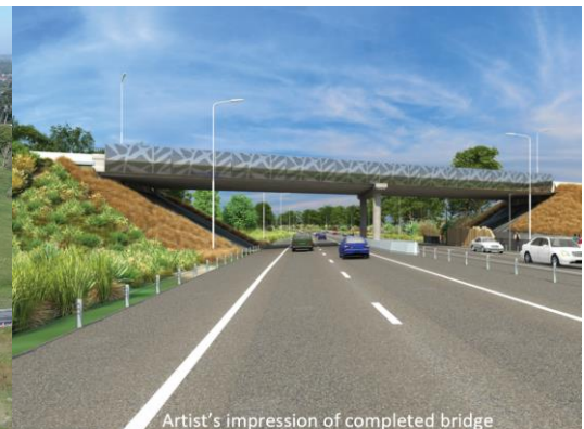
Artist's impression of completed bridge

Some redirection of traffic will occur April/May but good management plans are ensuring that the contractor is making every effort to avoid major disruption to traffic flows.