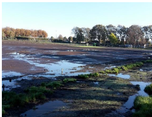
Surface water from the rain on 28–29 April

The St Albans Park project has been effected by the recent wet weather with the ground conditions and associated delays putting significant pressure on the project budget. Works have started for the lift station with the sheet piles being driven and the well points started. The balance of the works are still very subject to suitable ground conditions. The surface needs to be dry to complete the sand slitting prior to the application of the sand layer.