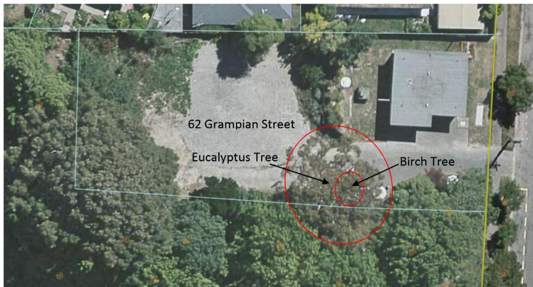
Figure 1: Site Plan

The trees to be removed are located on the site plan below.