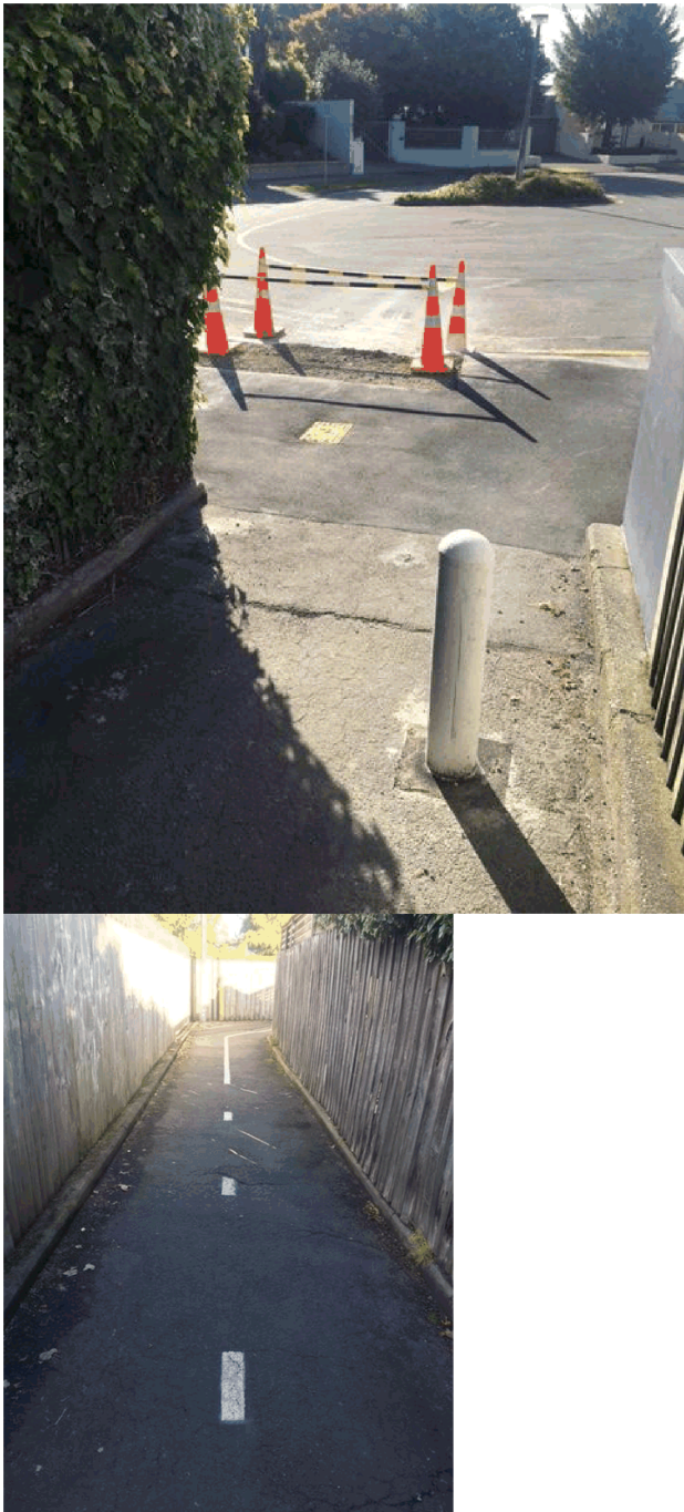
Current layout of Northern end of access way (top) and mid-section (above).

Transport Asset Planning Unit □ Civic Offices □ 53 Hereford Street □ PO Box 73014 □ Christchurch 8154