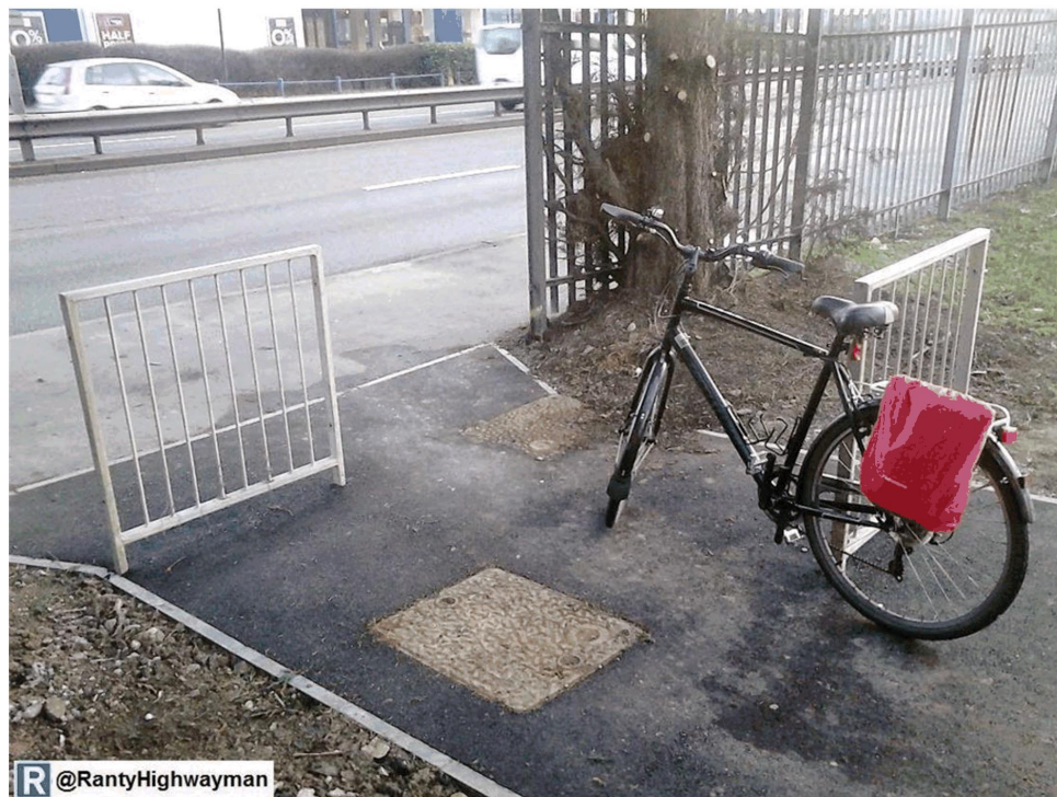
Photo A.) Example of a 'filled' staple barrier (less chance of users colliding with these than the traditional staple units)

Transport Asset Planning Unit □ Civic Offices □ 53 Hereford Street □ PO Box 73014 □ Christchurch 8154