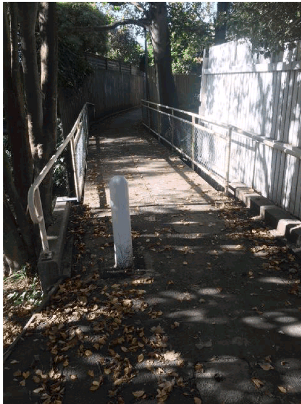
Current layout of southern entrance of access way (above)

Transport Asset Planning Unit □ Civic Offices □ 53 Hereford Street □ PO Box 73014 □ Christchurch 8154