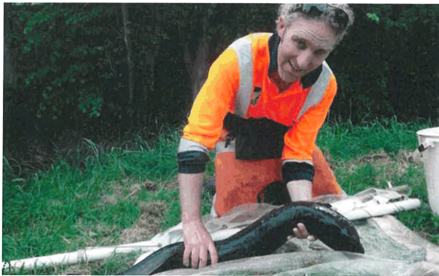
Council contractors relocating a 70 year old longfin eel at Dudley Creek this week.

Caught as part of a fish relocation programme, the lovely lady, estimated to be at least 70-years-old, was moved out of the current work zone to a spot further downstream.